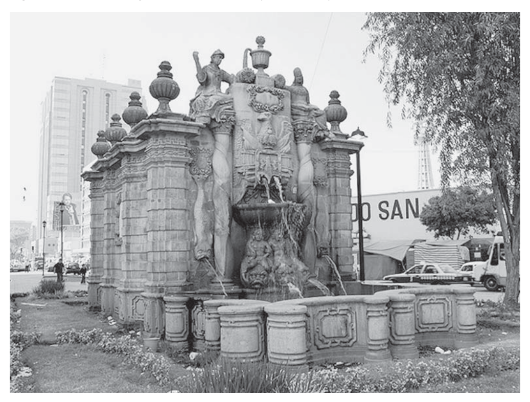
Figure 5: The Salto del Agua fountain, Mexico City, 18th century

by the icon of the Ermita transfer station (between Line 2 and Line 12), which depicts an eremitic chapel. The icon of the San Antonio Abad station (also located along Line 2) portrays a silhouette of St. Anthony the Great (ca. 251–356), whose personage reminds us of the exmonastery of the Augustinian order (which had been situated near the station).