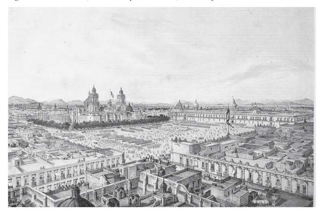
Figure 6: Casimiro Castro, the Parade Square of Mexico, 19th century

Source: Adapted from Nación de imágenes, la litografía del siglo XIX.