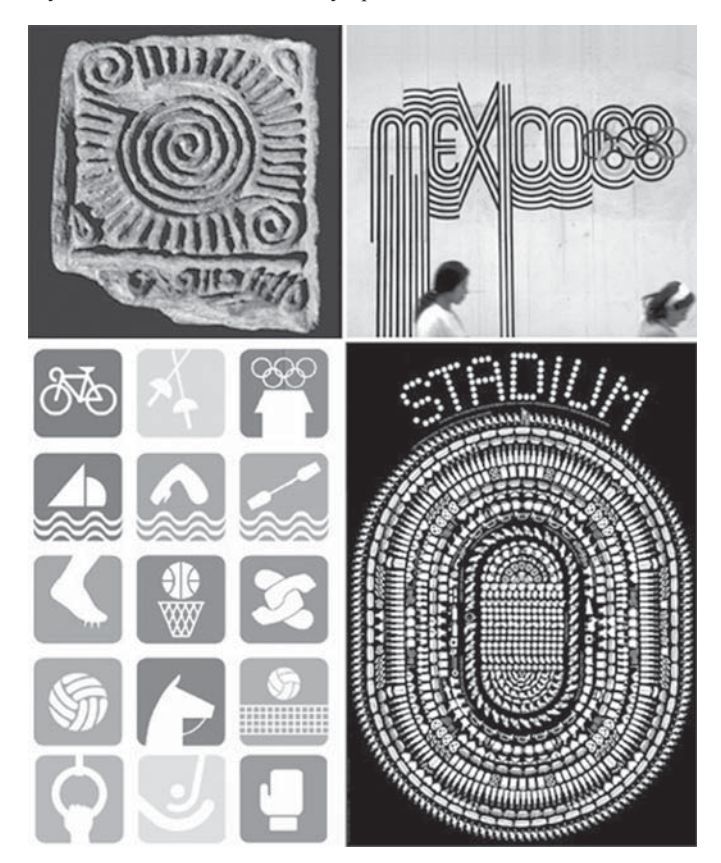
Figure 1: Lance Wyman, Icons of Mexico 68 Olympic Games, 1968