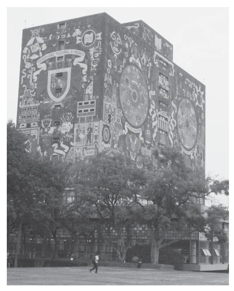
Figure 7: Juan O' Gorman, Central Library of National Autonomous University of Mexico, 1950–1956