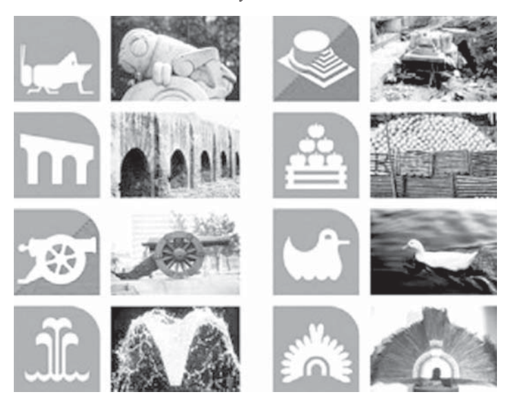
Figure 3: Icons of the first line of the Mexico City Metro