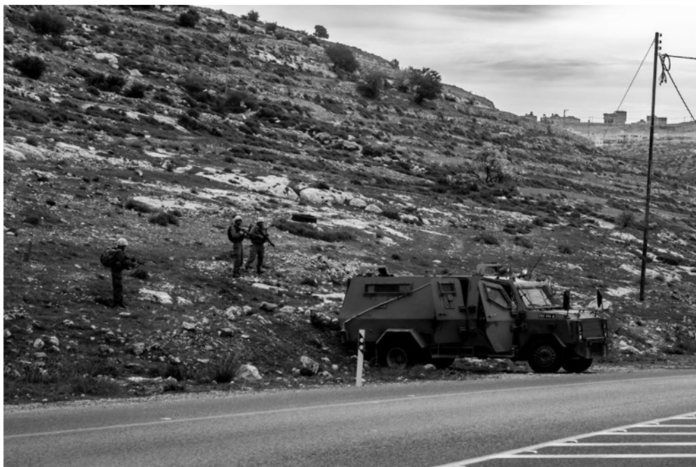
Picture 8: Israeli mobile checkpoint along Road 60.

Here, “under conditions of necropower, the lines between resistance and suicide, sacrifice and redemption, martyrdom and freedom are blurred” (Mbembe 2008: 177).