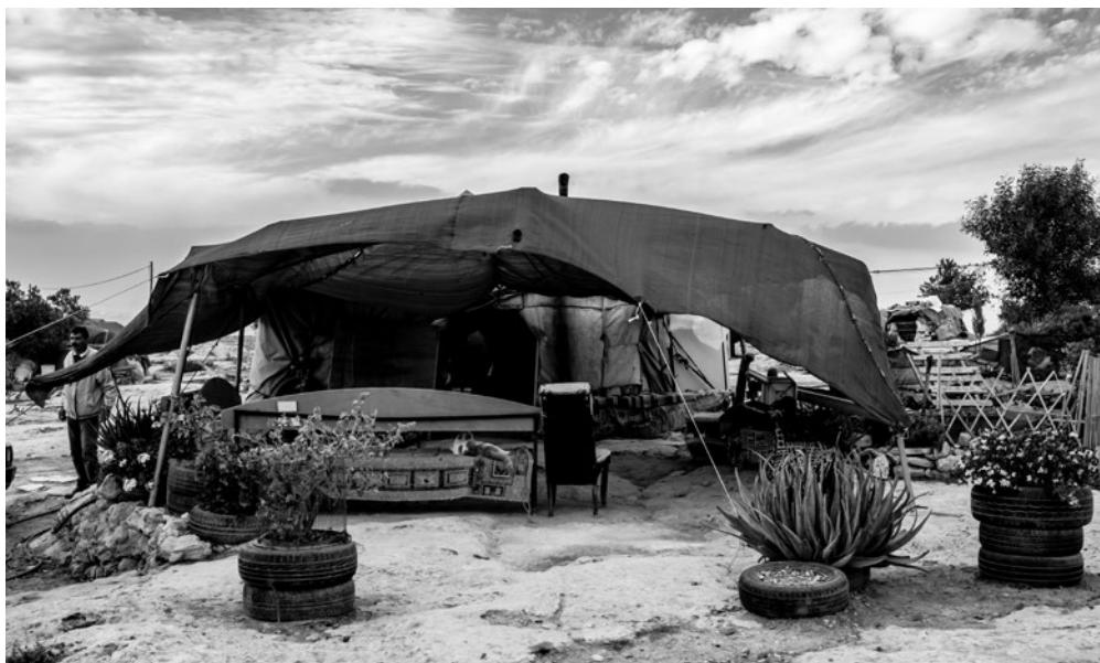
Picture 6: Housing unit in Area C Susyia, interior.