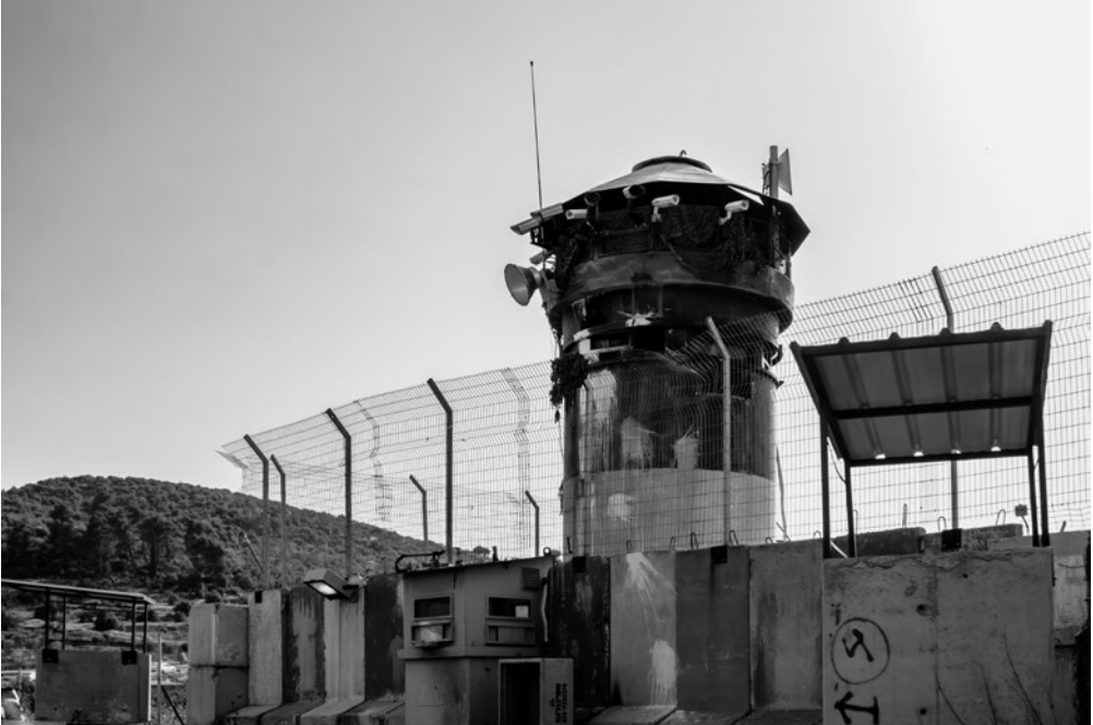
Picture 7: Israeli military barracks along Road 60.

The siege of Yatta, rather than producing docile bodies, a dispossessed “reserve army of labour”, produces indocility. Trapped youths find no solutions other than returning the violence against Israelis. The colonized body, from being a place of control, becomes a weapon, embodying the brutal form of necropower 27 , a radical form of subjectivity which is not willing to accept politics as a form of mediation (Fanon 1963: 33–94; Mbembe 2008). In this form of sudden and blind uprising, rage as a political phenomenon must be recognized. The lack of clear claims, achievement of rational targets, and even collective planned action could make us assume this is not political. Here politics cannot embrace the form of reaching compromise between different instances, where no common public space is given. Politics rather than acting as “being together with others, acting in concert and speaking with each other” (Arendt 1998: 162) is a “re-action” to the caging conditions of the lawscape.