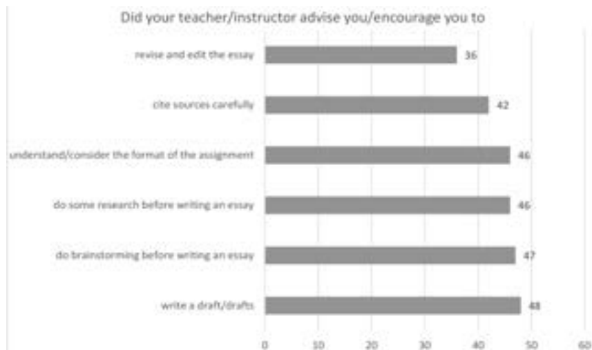
Figure 2: Instructions on the writing process

format of the given written assignment. A slightly lower number (42) reported that they had been advised to cite sources carefully and the lowest number (36) was instructed to revise and edit their essays. These results prove that the majority of the respondents had a chance to learn at least something about the five important stages of the writing process, i.e. brainstorming, preparing, drafting, revising and proofreading (cf. Hamp-Lyons & Heasley 2006), in preparation for the writing of a Master's thesis.