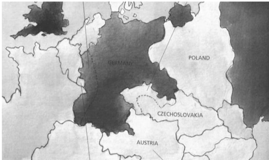
Fig. 1. A distorted presentation of cartographic information (substantial distortion of the international borders in Central Europe in the late 1930s). 39

Some of the textbooks also incorporate statistical data. These include the results of public opinion surveys conducted on samples of British citizens in March and October 1938 inquiring whether they would be in favour of Britain offering assistance if Czechoslovak territory were to be occupied by Hitler's Germany (the majority of respondents were not in favour) and asking whether they believed Hitler's assurance that he had no more territorial ambitions in Europe (92% of respondents did not believe him). 40 Students can also work with the results of two surveys conducted in 1937 asking respondents whether they supported global disarmament (most were in favour) and asking whether they would be prepared to volunteer for military service if war were to break out (most rejected this idea). 41