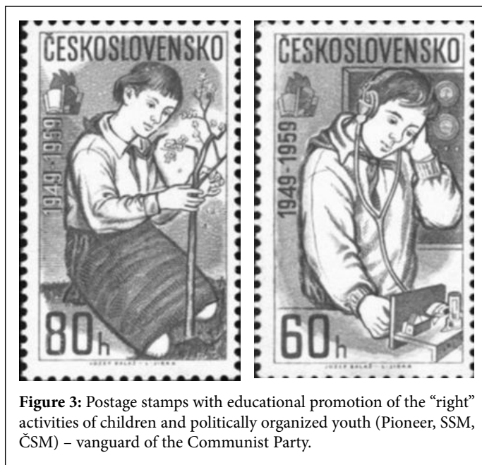
Figure 3: Postage stamps with educational promotion of the “right” activities of children and politically organized youth (Pioneer, SSM, ČSM) – vanguard of the Communist Party.

The main theme of the comic books followed is the story of a boy group. Isolated application in teaching would be problematic, but with help of other didactic media they offer a suitable tool for concretising the pupils' abstract ideas of ideological indoctrination by totalitarian regimes. Tasks: Compare specific boxes containing memories of communist workers with an extract of a text written by a historian. In different media, identify the forms of ideological influence on youth (posters, caricatures). Think about congruences and differences. Note the differences between contemporary and current evaluation. Think about the influence and significance of educational role models and anti-models for young people. Provide examples of comic book boxes, caricatures, or posters that depict