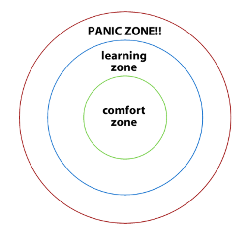
Chart 1: (http://blog.pickcrew.com/getting-out-of-your-comfort-zone-why-its-hard-and-why-you-should/)