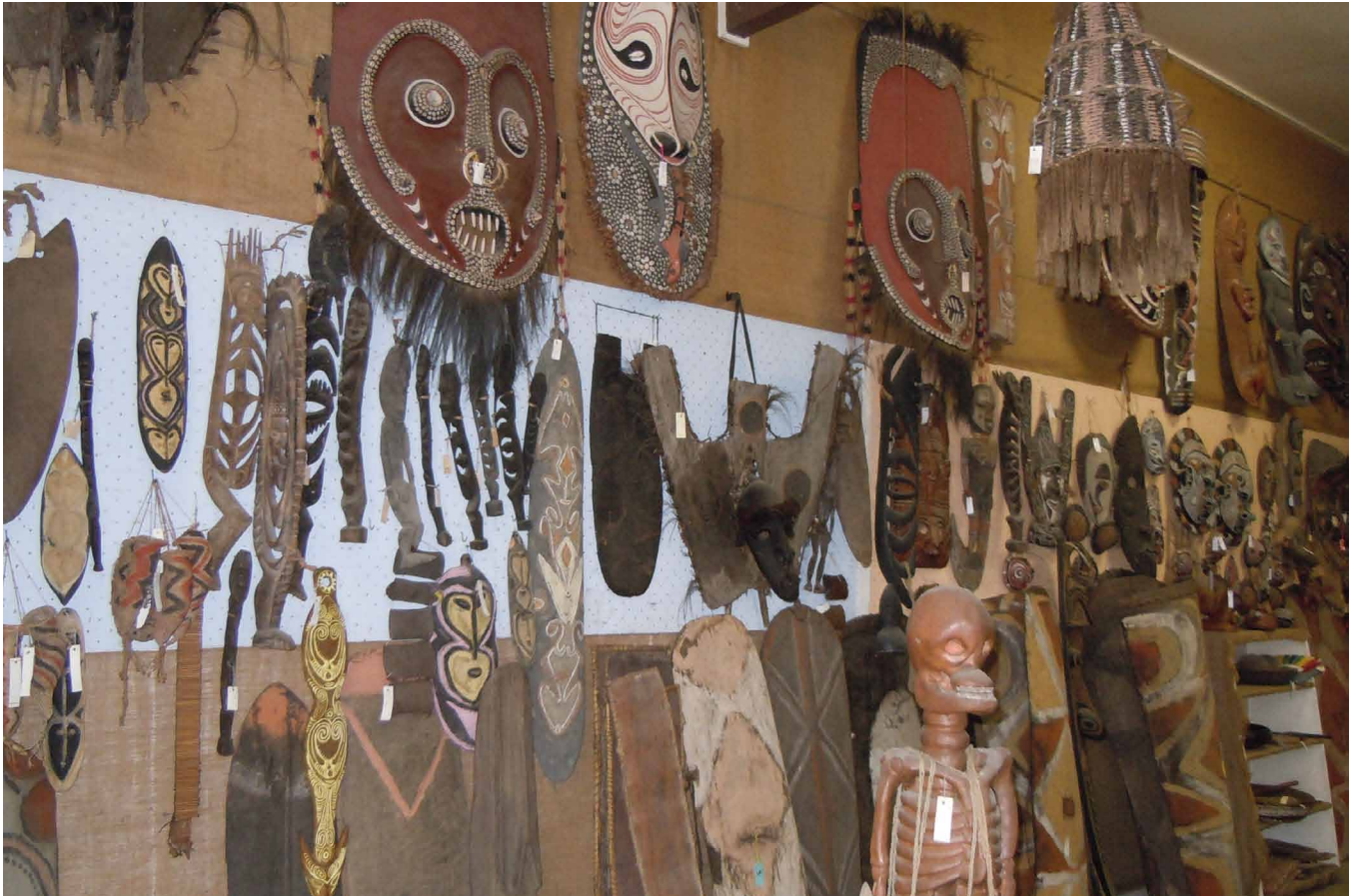
Fig. 8. It is the tradition that sells.