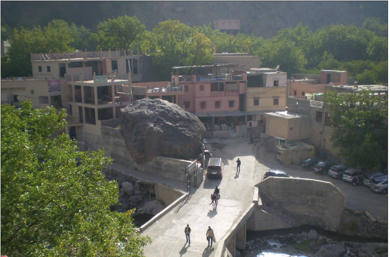
Fig. 2. View to the Imlil village.

changing the host community's culture. Another way to treat tourism is actually at hand; the next approach engages acculturation as a standpoint.