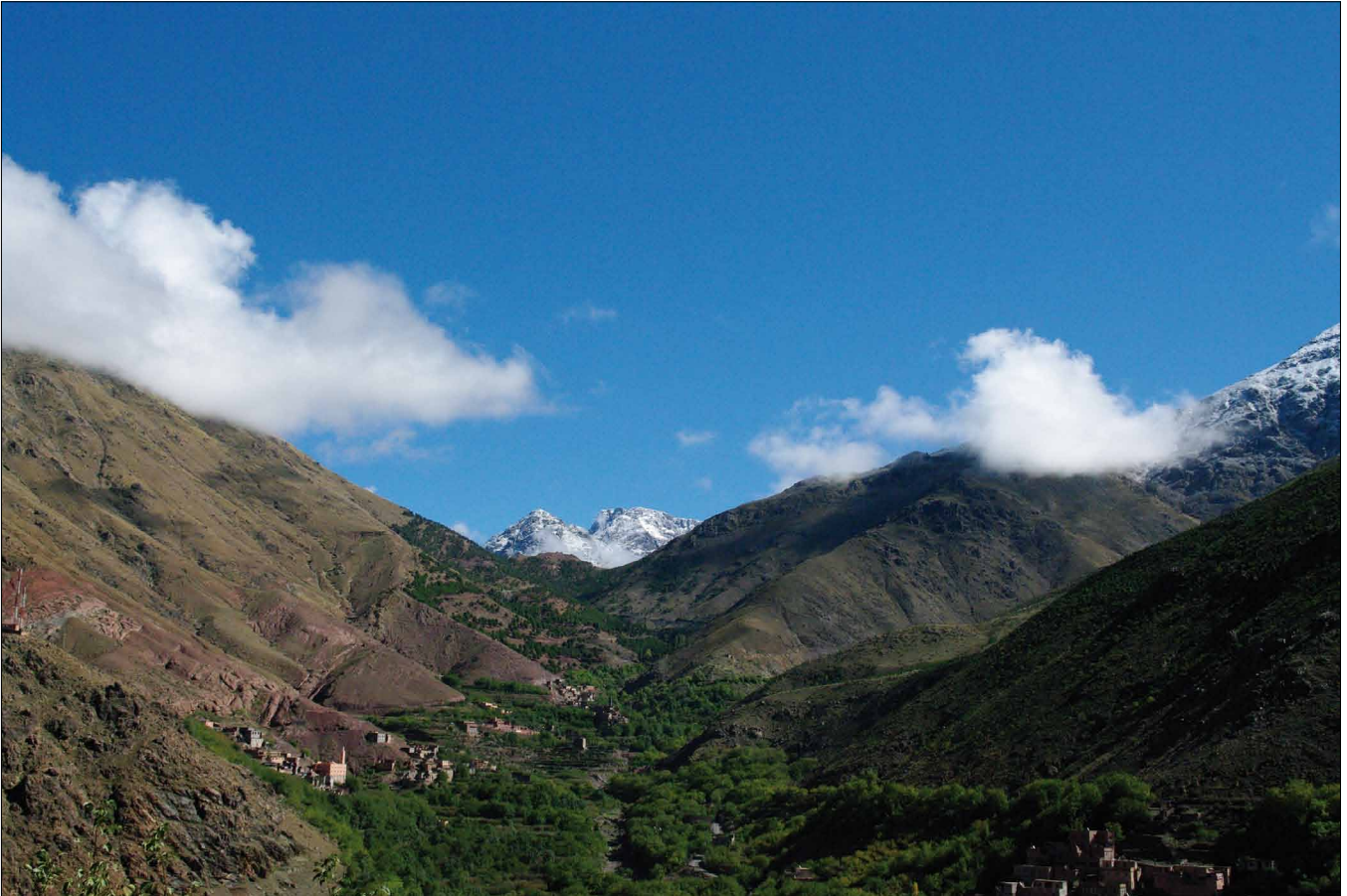
Fig. 1. Imlil Valley in the High Atlas Mountains.

ried. In a conservative Muslim society, such idea is inconceivable, and these two were expressing their amazement over the repeated disapproving reaction toward their confession. The debate, which arose hence brought us to discussions over the concepts of marriage, cohabitation and European liberalism, and this situation provided them an opportunity to think about who we are and how our social and cultural norms work in the context of the home society .