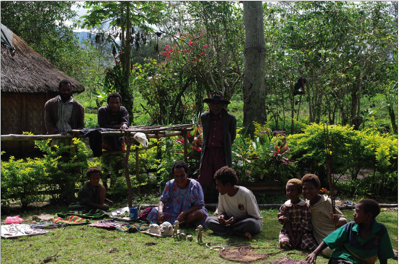
Fig. 7. Selling souvenirs in Komunive village.

and without being accompanied by a trekking guide, it can turn into a fairly dangerous enterprise. Statistics reveal that mountain climbing does not represent a leading activity carried out by tourists in the area. Only 13% stated it as the main reason of their trip to PNG (2011 Visitor Survey Report, 2012).