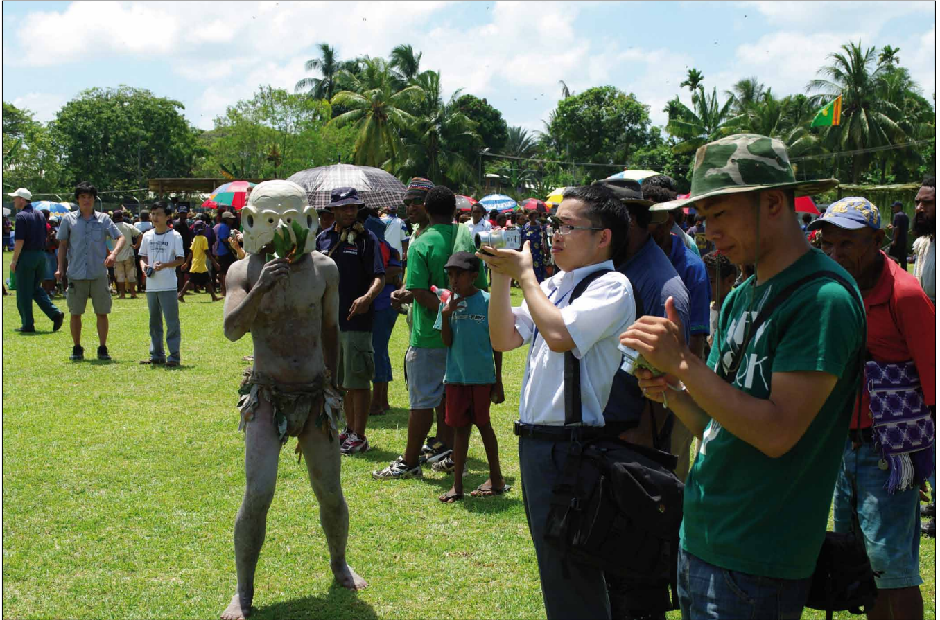
Fig. 6. Cultural show in Madang.

number of incoming people is augmenting year after year. We will turn our attention to the eastern part of the island – the politically autonomous state Papua New Guinea (PNG). A glance at the statistics reveals that in 2011 more than 164 000 people travelled to PNG. For the local economy, this number represents a contribution of 1.6 billion PGK 2 . 21% visitors of the stated count came to spend their holidays ( Visitor Arrivals Summary 2011, 2012 ).