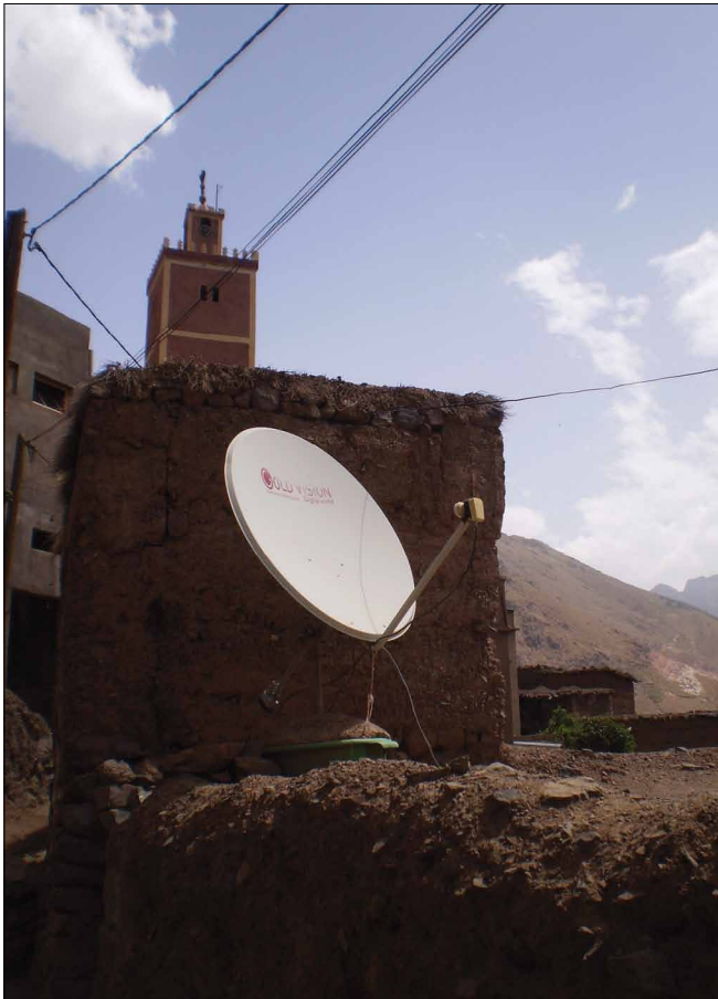
Fig. 5. Modes of acculturation.

The distinction between used and lost time is amplified by the migratory process for wage labour; jobs are always integrated into the wage labour frame with impersonal relations to the job market, implying it as a mere commodity. All in all, the whole paradigm has changed and the activities linked to tourism and wage labour; i.e. the prominent emergence of a monetary economy – seem to perturb the local reality. Many houses have invested acquired money into having running water in their homes. Not only are these local running water systems made of low-quality plastic piping that frequently leaks, but there is a social consequence to this change as well. People do not gather by wells to fetch water and gossip as they have done for centuries.