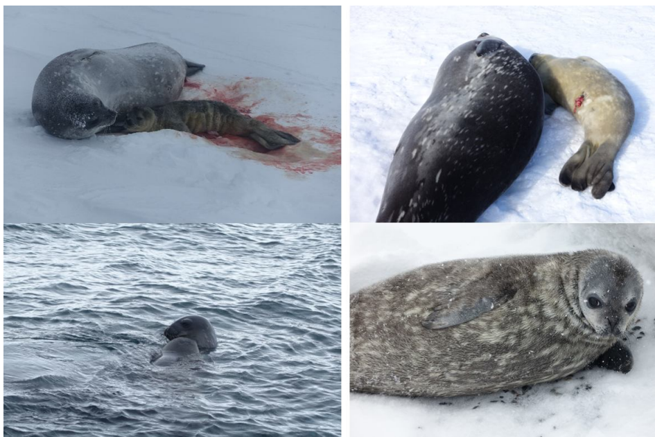
Fig. 2. Photograph records revealing main breeding events of Weddell seals during our study period. A female and a newborn Weddell seal on 27 September, 2015 (ID2, in upper left) which undried umbilical cord had been observed by day 12 after birth on 6 October (in upper right), and their swimming behavior was first observed at day 18 on 15 October (in lower left). Molt was initiated from the head and the flippers of a seal pup at day 21 in October 14 th in 2015 (ID3, in lower right).

on 15 Oct. Since 22 Oct., ID2 family had not been observed. ID3 pup was estimated to be born on 24 Sept., and it was observed to swim with its mother from day 21 (14 Oct.) and molt from 20 Oct. (Fig. 2 in lower right). The pup was found dead on 27 Oct. with unknown reason and its mother had wandered around her cub for seven days after the pup death and then left the site.