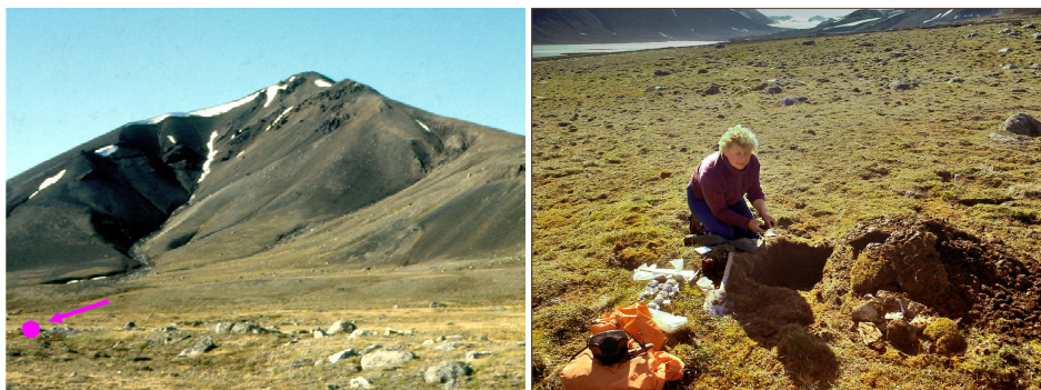
Fig. 3. a: Localization of our profile, b: Sampling from open pit.

was also observation of the vegetation in these climatically extreme and demanding conditions. We studied here the different conditions of changes in terrain, hydrology, amount of sunlight, nearness of permafrost, influence of erosion and fauna in this environment of High Arctic landscape. The aim of this observation was to specify palaeoecological interpretation of pollen analytical results from the sediments of glacial age originating from Central Europe.