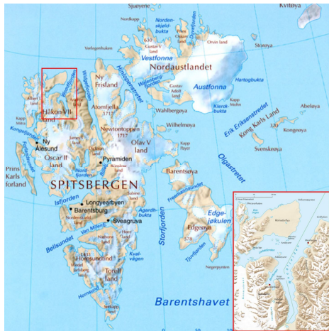
Fig. 1. Svalbard - area under study.