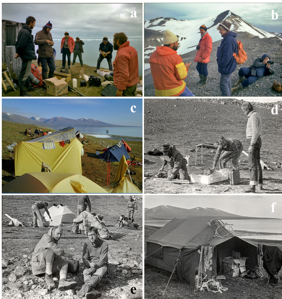
Fig. 2. a-c: Expedition „Svalbard 1988“, d-f: Expedition „Svalbard 1988 - retro“.

Meodden and Agardhdalen, Rosenbergdalen, Sassendalen and Adventdalen and other localities (closer information in Jankovská 1994).