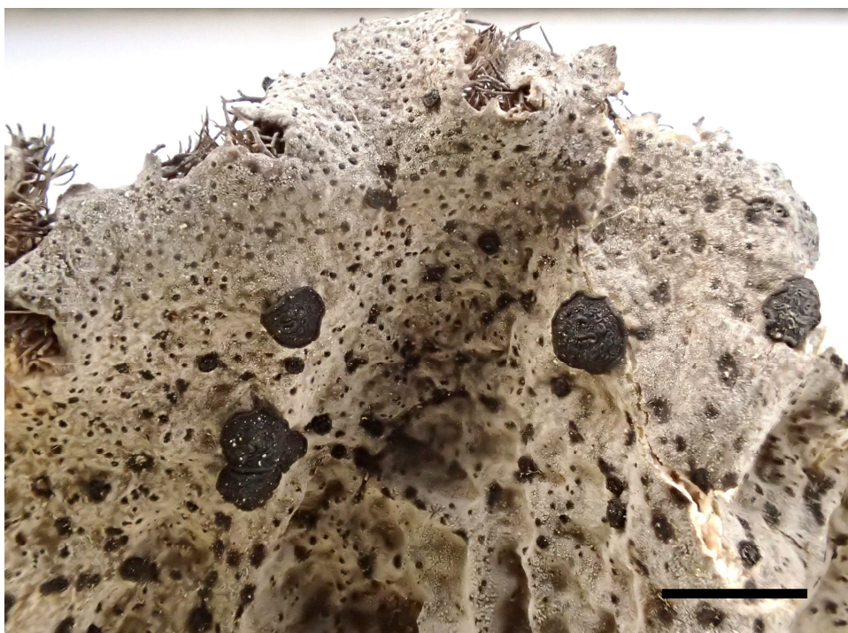
Fig. 5. Upper surface of Umbilicaria maculata Krzew. et al. with maculae and apothecia. Scale bar = 5 mm.

** Umbilicaria maculata Krzew. et al. (Fig. 5) – on siliceous stones, 1, 2, ALTB. – Rare species. Umbilicaria maculata was recently described from Europe (Krzewicka et al. 2009). It is known from Russia from the Altai Territory, the Republic of Altai and Kabardino-Balkaria (Davydov et al. 2019). It is characterized by having a monophyllous, flattened, maculate thallus adhering to the substratum, with sparse or lacking cilia, and sessile omphalodisc apothecia with crenulated margin (Krzewicka et al. 2009).