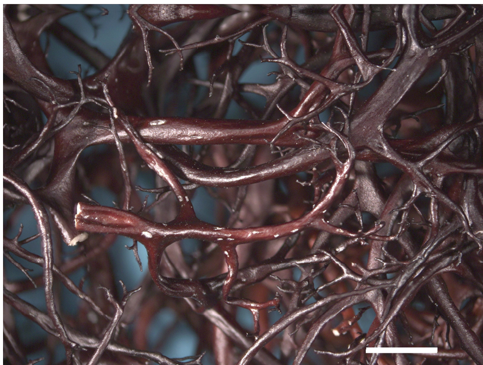
Fig. 3. New species to Russia – Bryocaulon hyperboreum Øvstedal. Scale bar = 2 mm.

! Bryocaulon hyperboreum Øvstedal (Fig. 3) – on soil, 10, 11, LE L17585. – It was described from Svalbard and was known from the Svalbard and Greenland until now (Øvstedal et al. 2009). The studied samples do not contain substances determined by TLC. Bryocaulon hyperboreum is very similar to B. divergens (Ach.) Kärnefelt, but the latter is distinguished by the presence of olivetoric acid, distinct, conspicuous pseudocyphellae, and a large angle between branches at the top of the thallus ( B. divergens – 78 \pm 5^\circ ; B. hyperboreum – 65 \pm 7^\circ ) (Øvstedal et al. 2009).