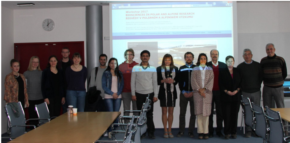
Fig. 1. Group photo of the workshop Biosciences in Polar and Alpine Research 2017 participants.